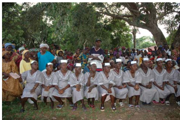
TBA's in their new 'Uniforms'