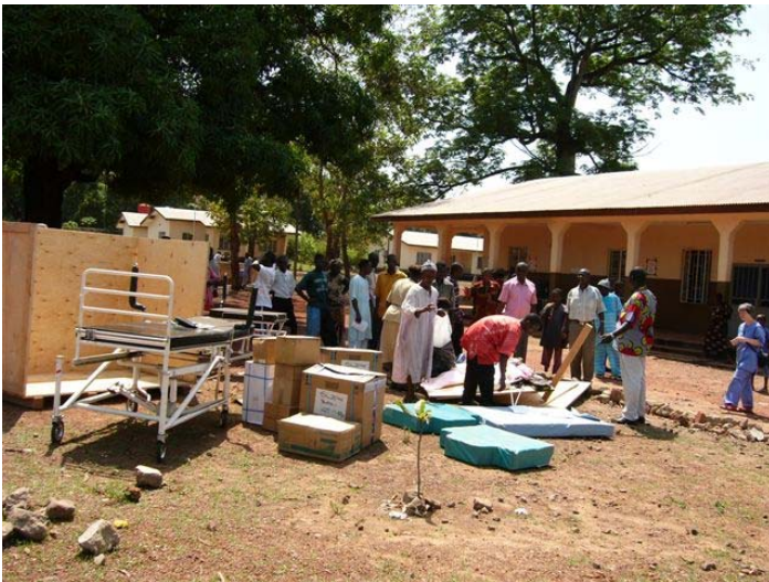
Contents of the Container being unpacked.